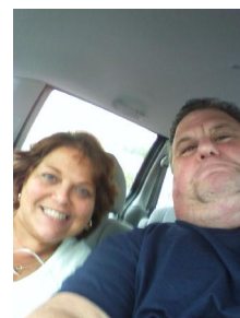
We take pictures in the car