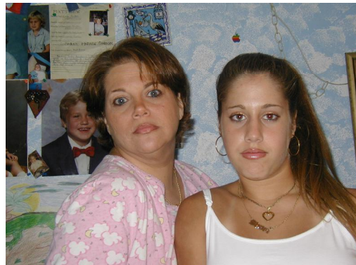
We are both the nicest people