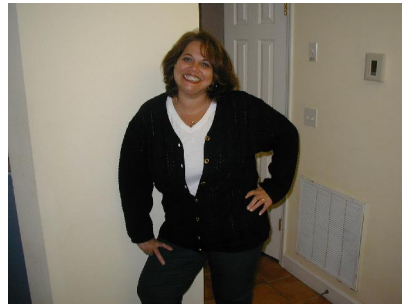
Always ready for a photo shoot