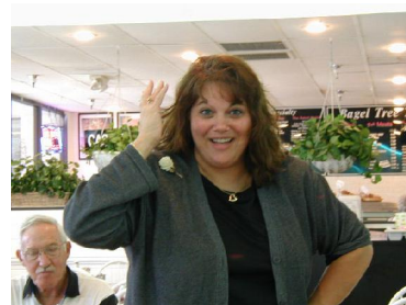
We are camera shy