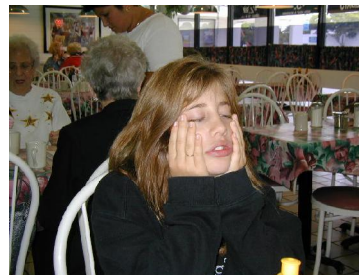
But there is never a dull moment