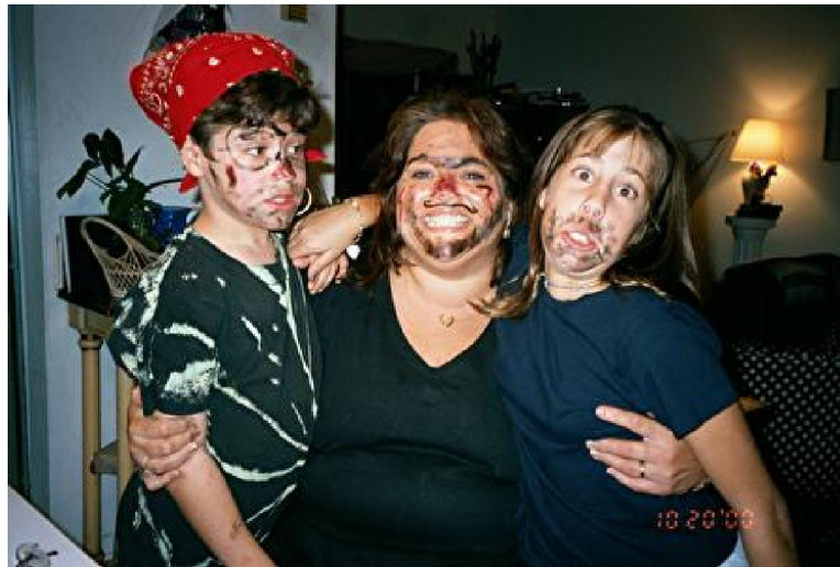
We love makeup